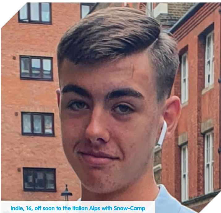
Indie, 16, off soon to the Italian Alps with Snow-Camp