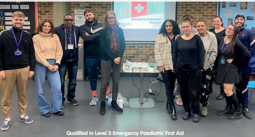
Qualified in Level 3 Emergency Paediatric First Aid

In January, eleven members of staff took part in an intensive day of First Aid training which covered both theoretical and practical First Aid protocols for adults, children, and infants. The Team left feeling confident and well-equipped with knowledge.