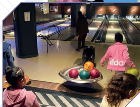
A week of enrichment

With your help, this safe and welcoming environment will continue to flourish.