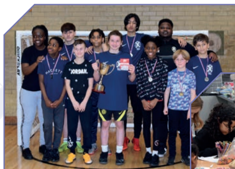
A week of enrichment