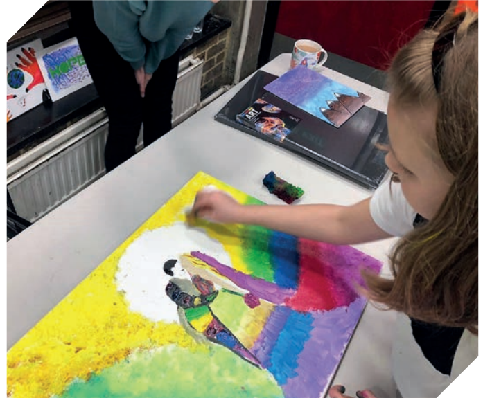
Members working with Forsters' staff on the theme of 'Hope and Togetherness'