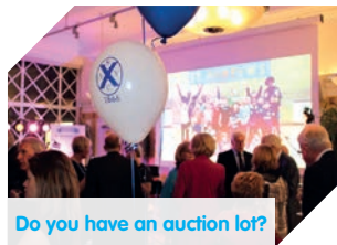
Do you have an auction lot?