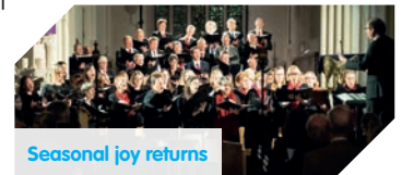
Seasonal joy returns

After a two-year hiatus, Yuletide, Comfort and Joy will return on Thursday 8 December 2022. The top-class performances will be generously arranged and sponsored by JBGB Events. The concert and reception will be in the Wellington Hotel by Blue Orchid, who also sponsor the evening. It will be a fantastic musical Christmas event. Watch this space for limited availability tickets.