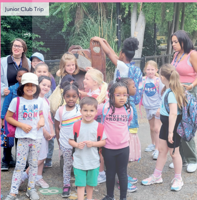
Junior Club Trip

From 25 July to 19 August, St Andrew's ran its four-week Summer Project for both Junior and Senior Clubs: providing a welcoming safe space for our Members to enjoy their summer together as part of our caring community. This also provided a much-needed respite for parents and carers trying to navigate this hectic and expensive time of year. In total St Andrew's enriched the lives of 74 Junior Club Members aged 5-9, with over 600 individual attendances. Senior Club had 1,014 individual attendances from 107 Members aged 9-17. Both Junior and Senior Club members had action-packed adventure-filled daily programmes full of opportunities and experiences to develop their confidence, make new friends, tap into their imaginations, and learn new skills, with a range of activities from creating glitter pictures and paintings; constructing Lego structures; and taking part in Master Chef-inspired games, such as cake decorating and dessert designing. Members were also able to enjoy off site trips to Legoland, Go Ape, Coral Reef Water World and Thorpe Park - taking part in a range of thrilling activities from roller coasters to zip lining. You can read more in our Website News.