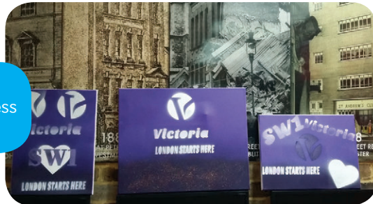
Art exhibition at the Club for members of the Victoria Business Improvement District