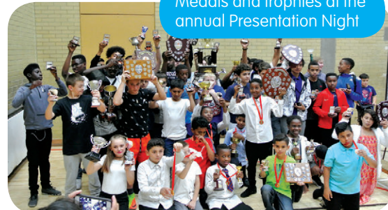
Medals and trophies at the annual Presentation Night