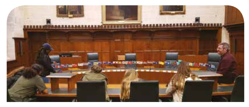
A day at the Supreme Court Members had a fascinating day out representing the Club and learning about the history of our legal system.

Our members, who are instinctively good at understanding new apps and technology, have been tasked to script and film on a phone a short insight into Club life and the importance of our youth workers. This will be used as a fundraising tool.